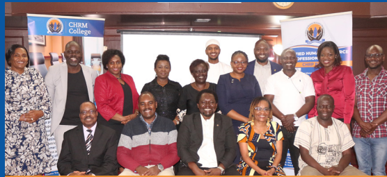
HR to CEO Cohort 1 Graduation