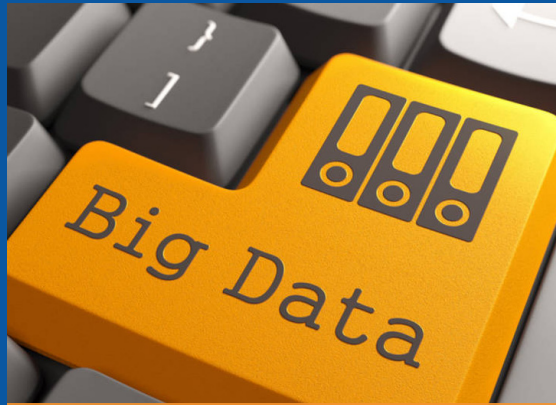
Executive Certificate in HR Analytics Big Data