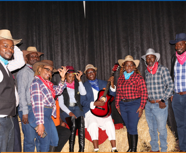
The Night that was