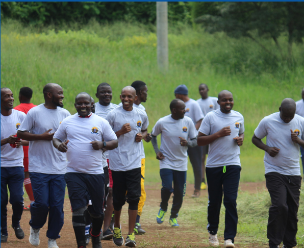
CHR College Sports Day